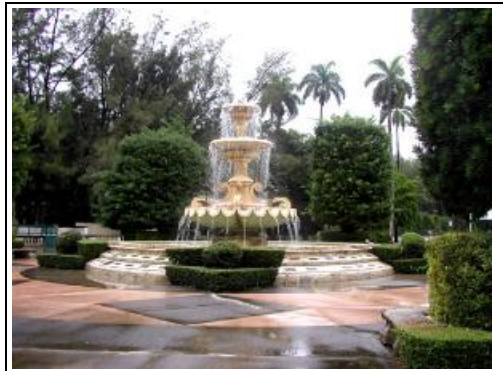
The flamingo fountain at Hialeah Park Race Course, Hialeah, Florida.

The Mediterranean Revival clubhouse has a sweeping formal staircase and broad terraces and a memorable landscape marked by grand rows of trees and tropical gardens. In 1939 the Audubon Society declared Hialeah Park as a Flamingo Sanctuary. The site is an important community resource, hosting events in its ballrooms and providing green space in a crowded and growing area.